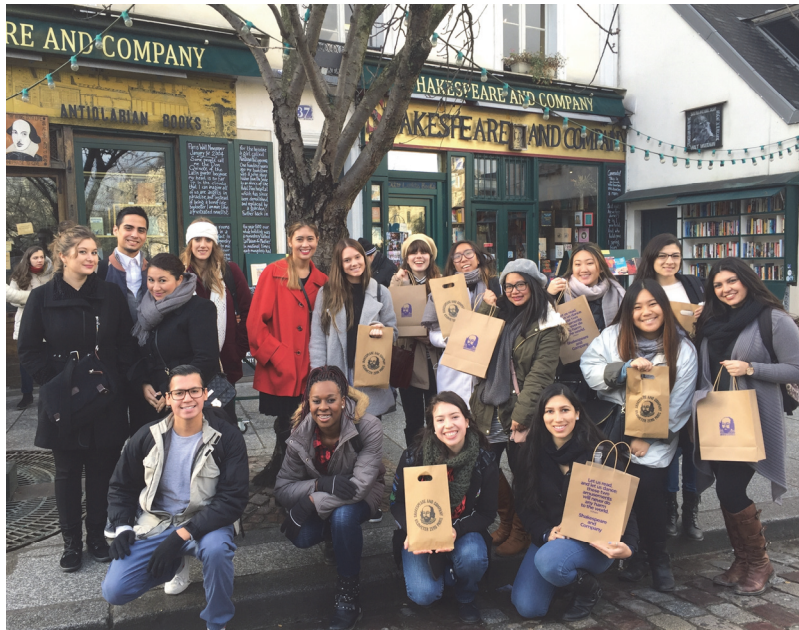
Cal State Fullerton students outside the famed Shakespeare and Company bookstore. First built in 1919 and then shuttered in 1941, the English-language bookstore was revived ten years later and has been open ever since

And we wrote. The students were, after all, taking courses on writing and literature. We wrote about streets that smelled like perfume and cheese that smelled like stinky feet. We wrote about listening to jazz at Le Duc de Lombards and about listening to words we couldn't understand at a sidewalk café. We wrote to record our memories, but we also wrote to better understand our experience living and studying abroad. And, like so many before us, we learned that the best way to discover Paris is by writing about it.