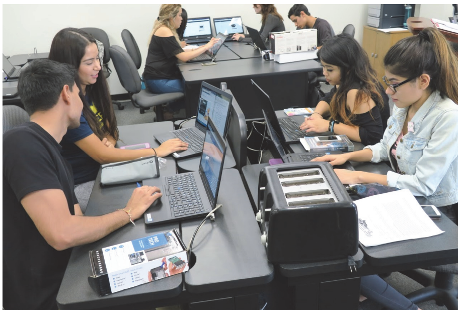
Students collaborate on writing a repair manual for a broken toaster

It's a Wikipedia-style website, but rather than defining terms, it instructs people how to repair or replace broken parts on their electronic gadgets, whether it's a phone or a toaster. iFixit works with me—they have an education department dedicated to the task. Their chief motivation is environmental: they want to teach people how to fix gadgets so they don't have to throw them away.