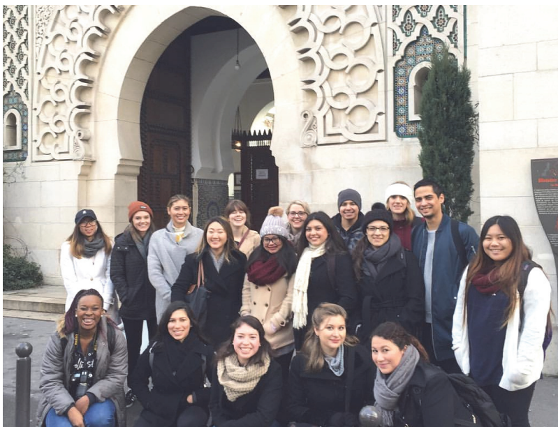
Students learning about the Grande Mosquée, a mosque founded in 1926 that was later used to shelter French Jews during the Nazi occupation